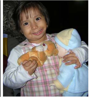
Christmas 2006 at 34 months