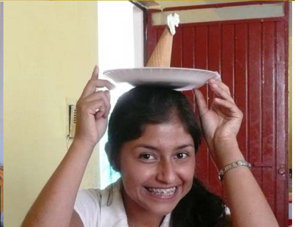
Ciudad youngsters had a fun time with the "clown ice cream cones" made for them during Spring Mission Week 2009!