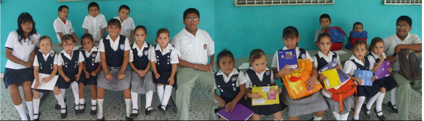
Some of the adorable children don their new school uniforms, shoes and show their new school supplies to donors. Without your help, required school uniforms, shoes and school supplies would not be possible.