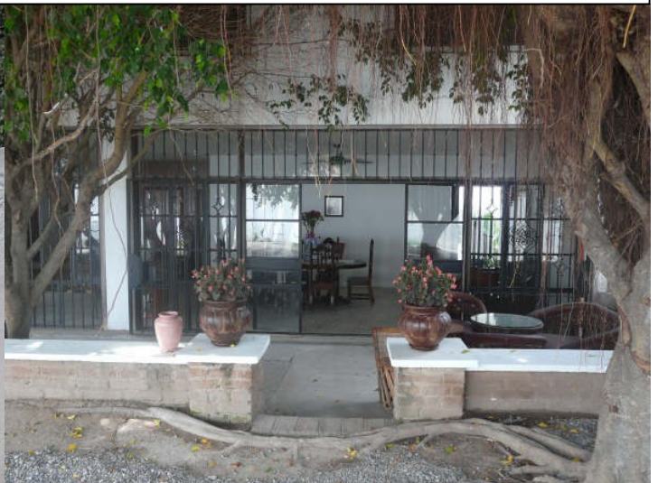
What a difference a day, lots of love and plenty of paint makes! THANK YOU TRES ISLAS DONORS!