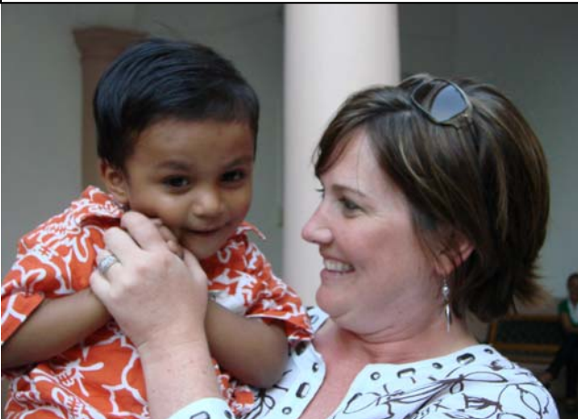
Children and donors enjoy the fiesta at Orfanatorio Mazatlan during Spring Mission Week 2009.