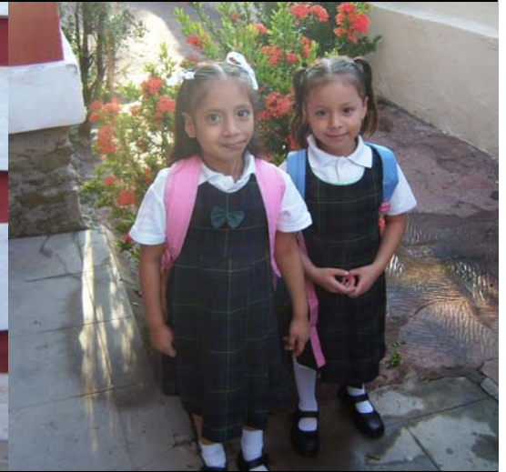
The children are thankful to donors for helping them begin school with new school uniforms, shoes, backpacks and school supplies.