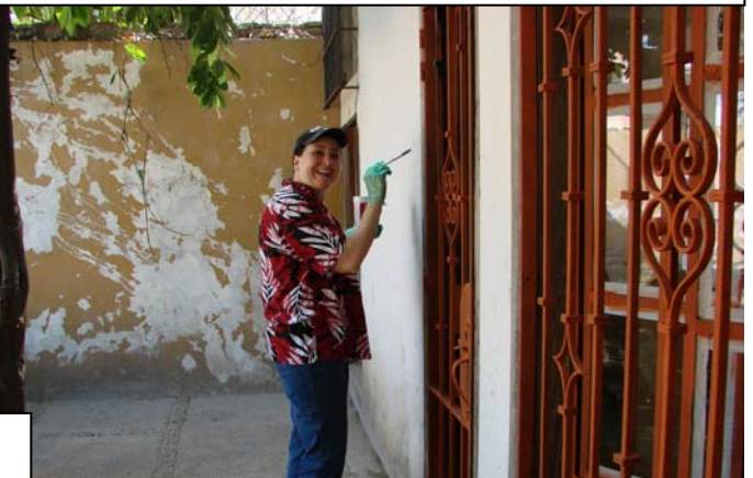
Welcome to newest orphanage FloreSer – which means to bloom and blossom – the first of its kind in Mexico – devoted to rescuing girls who have been sexually abused or been forced into a life of prostitution.