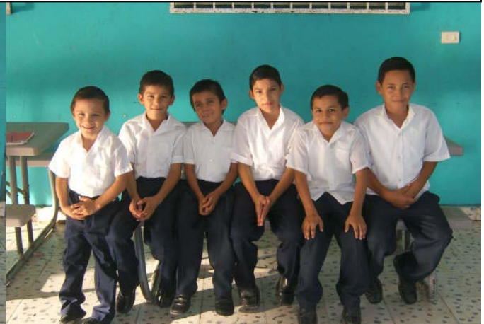
Some of the adorable children say "Thank you!" to donors for their new school uniforms and shoes. Without your faithful help, new uniforms, shoes and school supplies would not be possible.