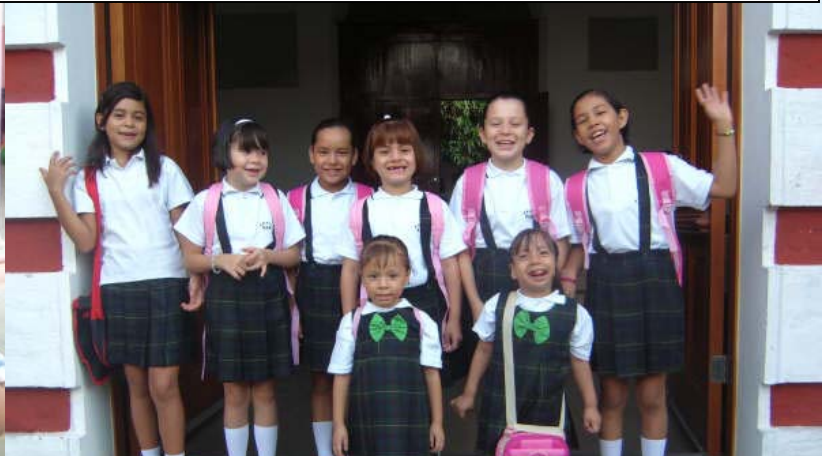
The children at Orfanatorio Mazatlan are thankful to Tres Islas donors for their new school uniforms, shoes, backpacks and school supplies. Can you see the happiness on their precious faces?