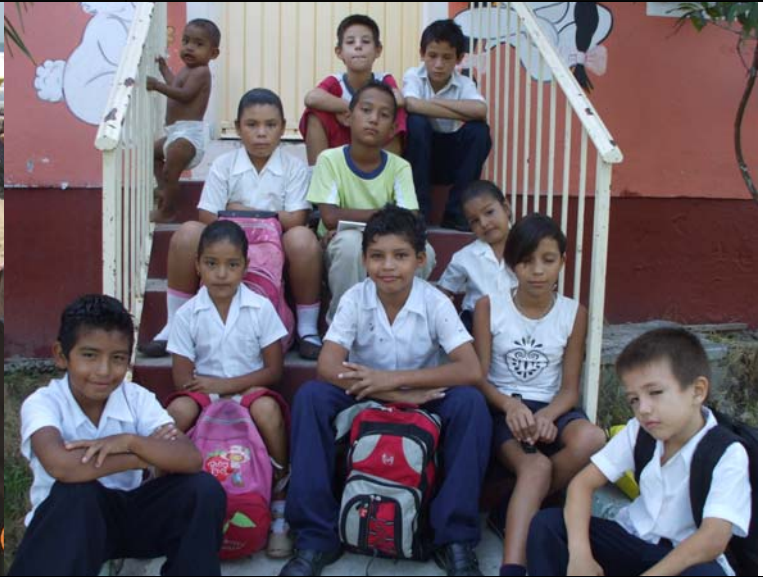
Children from all four orphanages arrive for food and fun at the Spring Mission Week's beach BBQ fiesta in April thanks to the generosity of you, the Fund's wonderful donors.